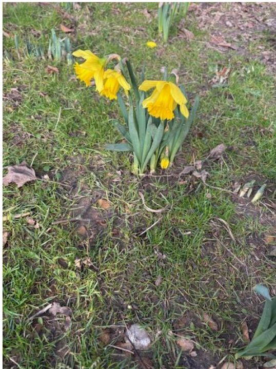
Spring has sprung at end of December at Stourhead.