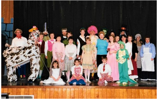
The Cast of thousands!! Do you recognize anybody?