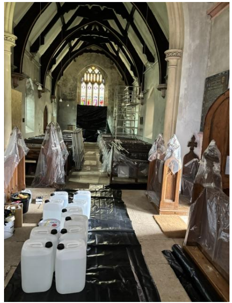
An empty St John's