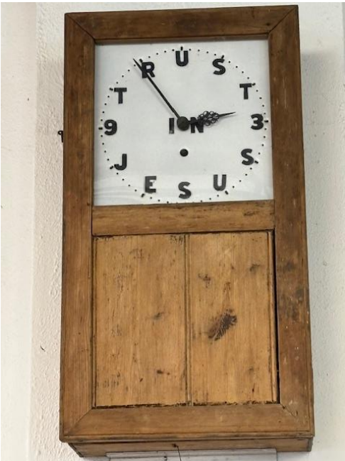
“Clocked” this time piece in a hall in Marston. On the “face of it”, what a true message !