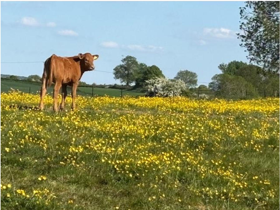
A view from St John's of a field of buttercups