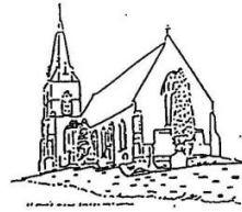
St John's Church, West Ashton Trowbridge, Wiltshire