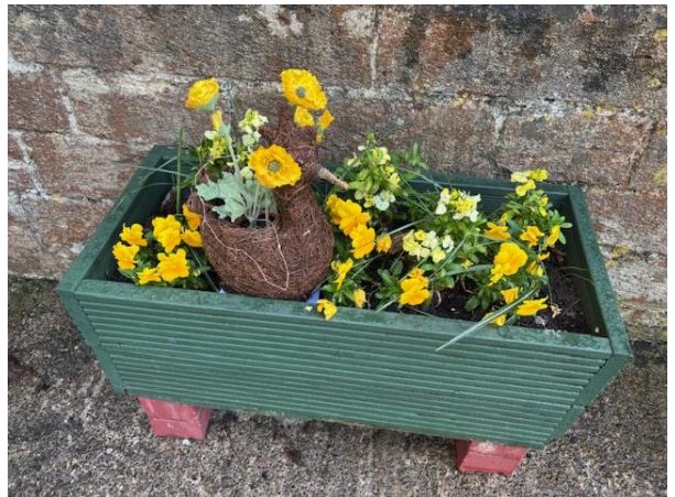
Easter Sunday at St John's