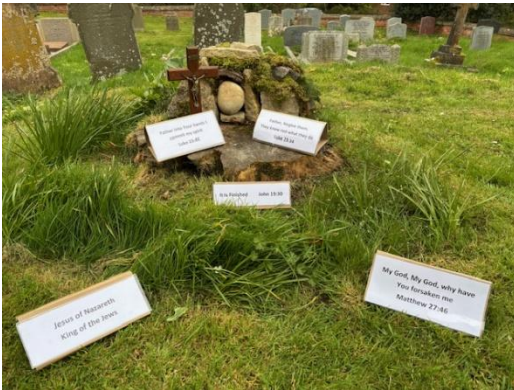
Good Friday at St John's