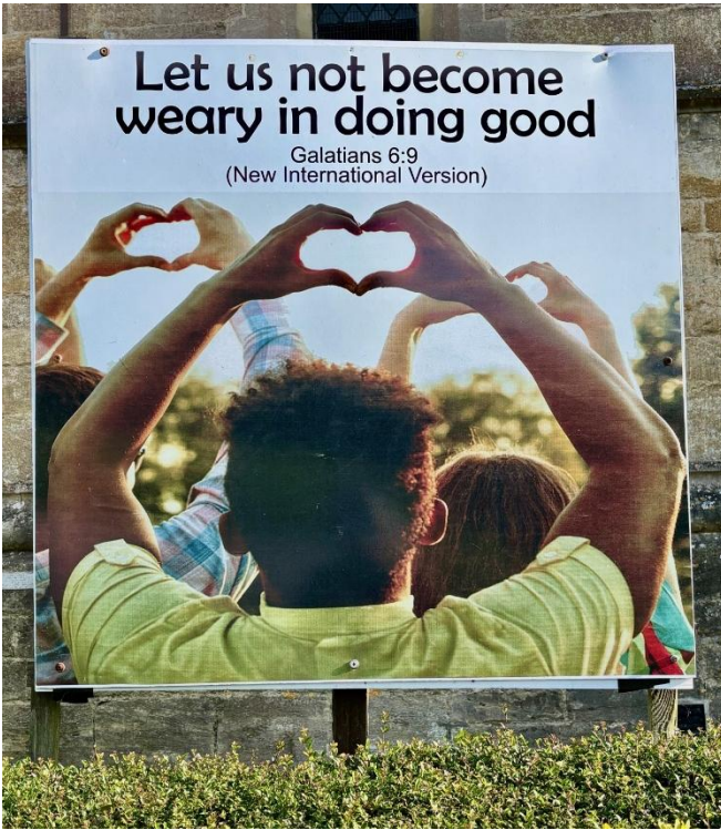
New Signboard at St John's